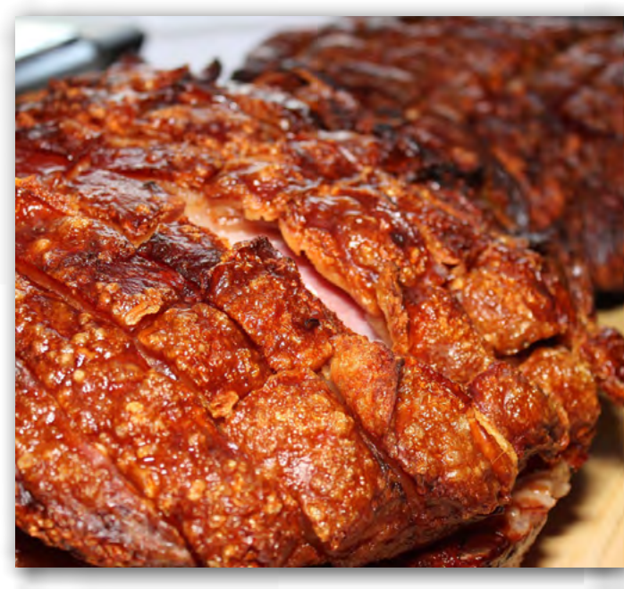
Presented at your table by our chef and accompanied by a selection of sides, this is the perfect meal to enjoy family style.

Bread Rolls - butter Cos Lettuce - parmesan dressing Steamed Seasonal Vegetables - butter Roasted Pumpkin - tahini, pepita Roasted Herb & Garlic Kipfler Potatoes Demi-Glace Gravy